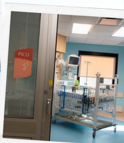
Patient rooms have been reconfigured to offer additional privacy for the patients and their families.