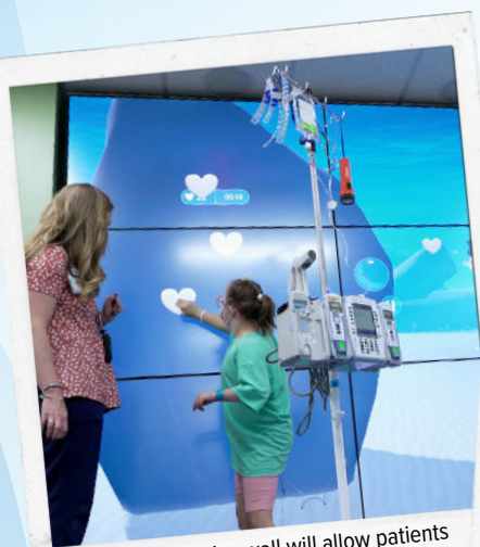
The new interactive wall will allow patients to get out of their rooms and participate in things like physical and speech therapy.

The children who are cared for in the PICU are medically fragile. This new space will improve our ability to care for them and their families.