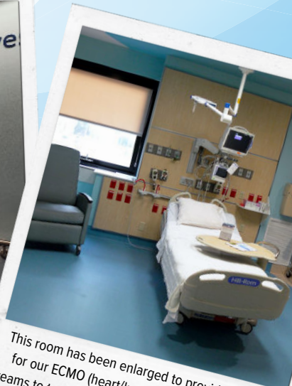
This room has been enlarged to provide a home for our ECMO (heart/lung bypass) and dialysis teams to treat patients in a new dedicated space.